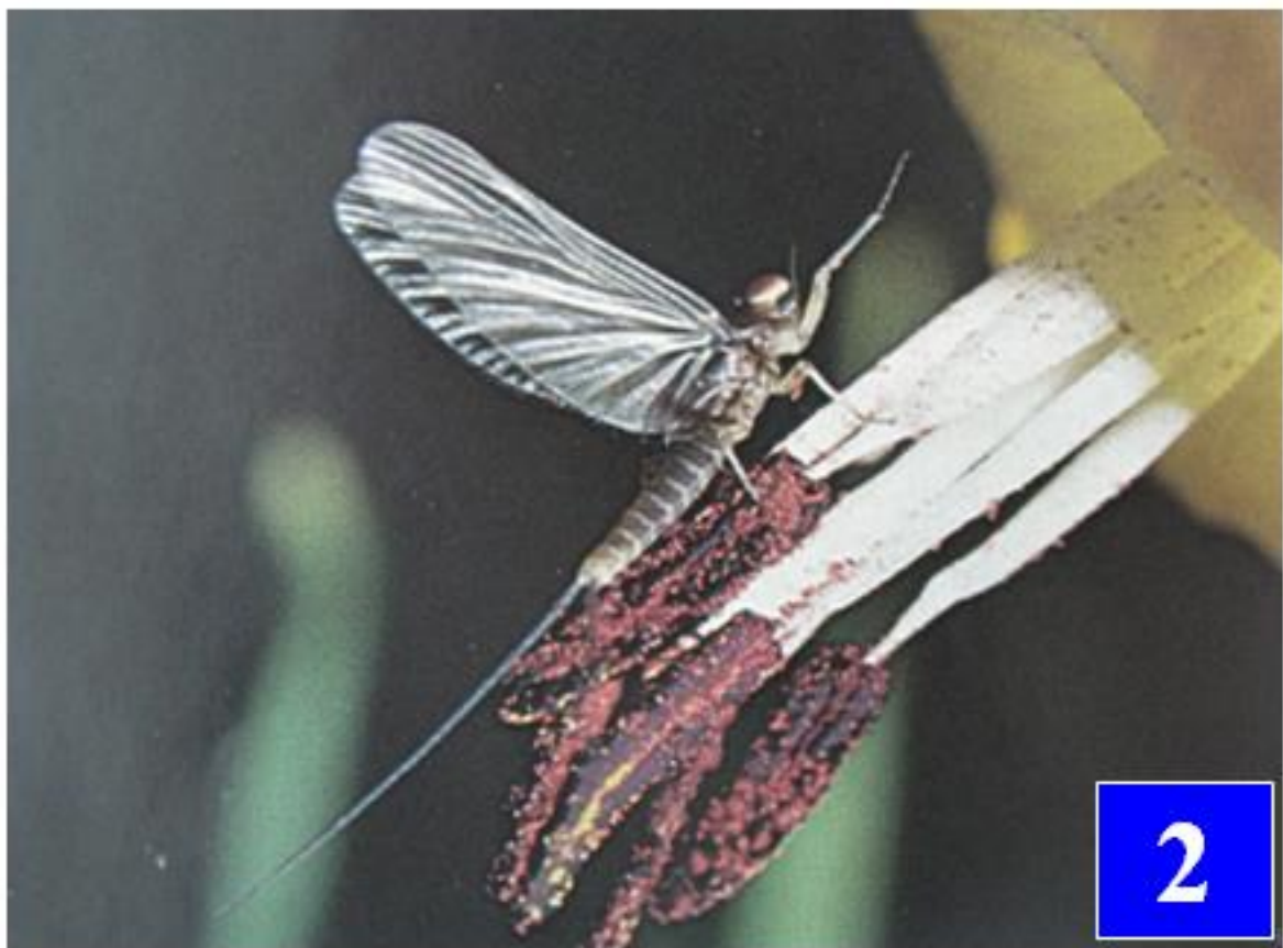
Hafele R, Hughes D. (1981) The Complete Book of Western Hatches: An angler's entomology and fly pattern field guide. Frank Amato Publications. Portland OR.