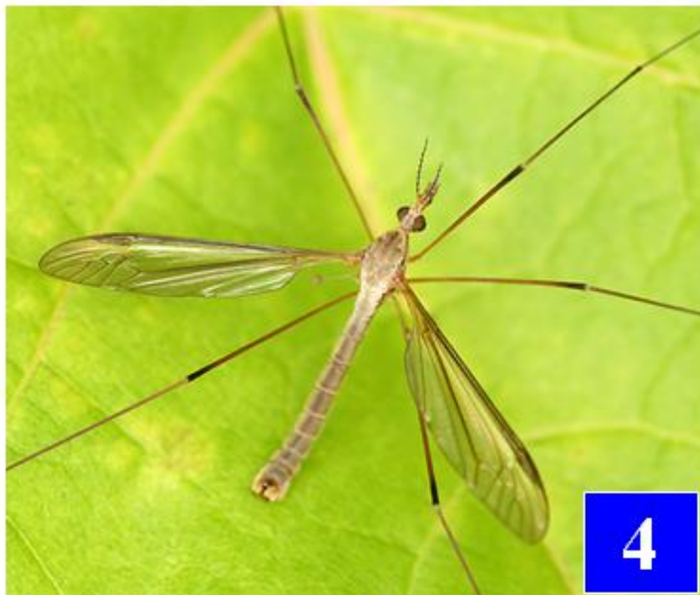
Hafele R, Hughes D. (1981) The Complete Book of Western Hatches: An angler's entomology and fly pattern field guide . Frank Amato Publications. Portland OR.