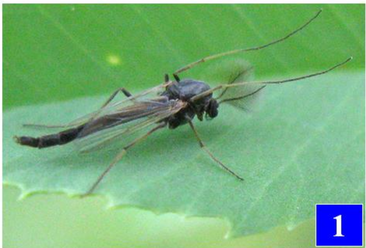
Hafele R, Hughes D. (1981) The Complete Book of Western Hatches: An angler's entomology and fly pattern field guide. Frank Amato Publications. Portland OR.