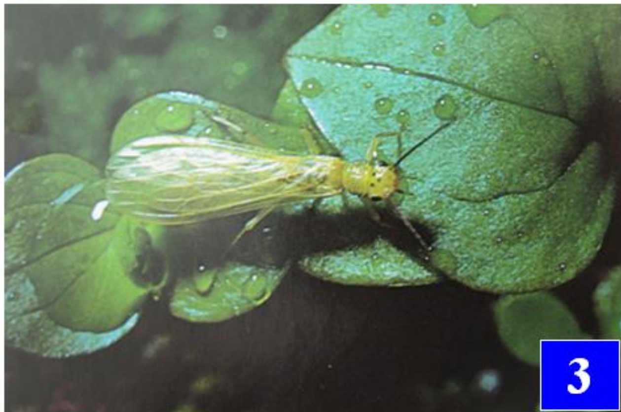
Hafele R, Hughes D. (1981) The Complete Book of Western Hatches: An angler's entomology and fly pattern field guide . Frank Amato Publications. Portland OR.